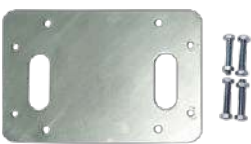
Base Plate (Optional)

*All specification is subject to change without prior notice.