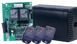
Transmitter & Receiver