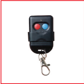
Remote Control (RG-CST-016)

*All specification is subject to change without prior notice.