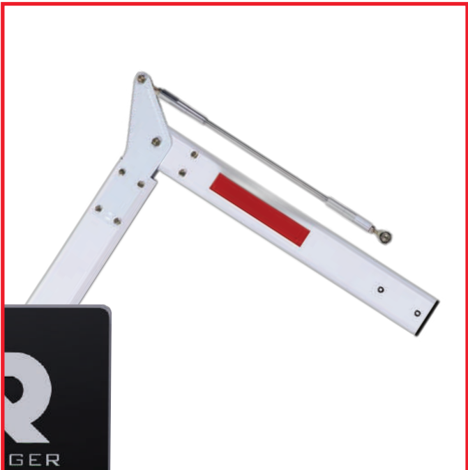
4M - 90° Folding Arm