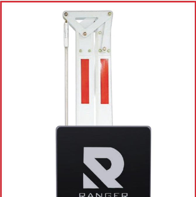
4M - 180° Folding Arm