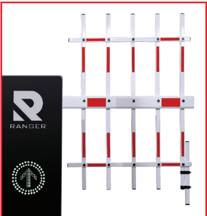
4M - 3 Fence Arm