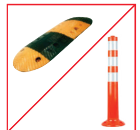
Traffic Cone & Speed Hump