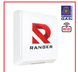
Long Range Reader