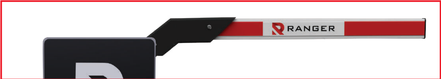
Default- 4.5M - Telescopic Arm