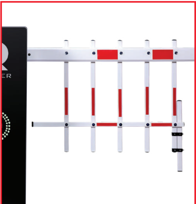
4M - 2 Fence Arm